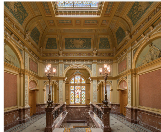
Royal waiting rooms

The food halls house a wide range of high-quality food concepts and a well-known name for gourmets. Founded by entrepreneurs, embraced by locals and valued by visitors from all over the world. The newest location is right in the heart of the city center of The Hague.