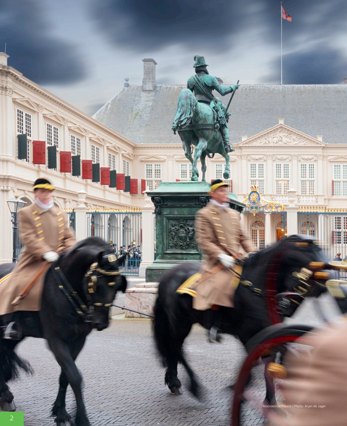
Noordeinde Palace

Some destinations should be cherished forever and The Hague is one of them. The international city of peace and justice; new styles and old masters; chain stores and royal palaces; exotic cuisine and fishing port; two beach resorts and residence of the King and Queen. The Hague is the only major Dutch city located at the sea. At just 15 minutes from the historical city centre, with no less than 11 kilometres of beach. A unique combination to experience the ultimate holiday feeling here in all four seasons.