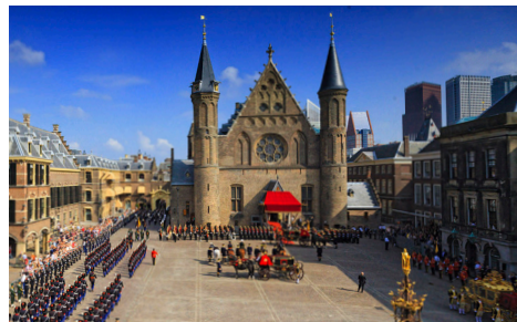
Prince's Day

The Ocean Race (formerly Volvo Ocean Race) comes to The Hague for the third time in the spring of 2023. The port of Scheveningen will be both the starting and finishing place of a leg this year.