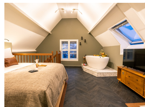
The Collector The Hague

It simply couldn't be more central but the courtyard Haagsche Bluf feels like an urban oasis, breathing serenity, cleanliness and character. Art, English tea, good food, great steak – all framed by 16th, 17th, 18th and 19th century copycat façades from various Dutch cities. Prepare to be enchanted, by the ideas and the craft of artists have put in each and every room. Whether you treat yourself to the Collector Loft loft or not for the The Gallery - it will never get basic.