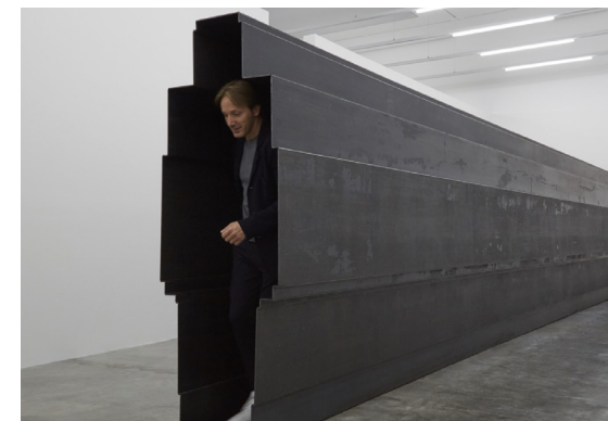
Antony Gormley - GROUND

Royal Delft strives to obtain the official museum status by mid-2021. This will enable them to accept the Dutch museum card and organize greater expositions. Starting with a new exposition in autumn 2021 about Dutch landscapes. Dutch landscapes with boats and windmills on Delft Blue plates are an iconic combination. Royal Delft will tell the story of how the famous Dutch ceramics and landscapes came together. Learn all about how Dutch painters moved outside for the first time in the 19th century to paint their landscapes in real life while visiting the factory that is still in production.