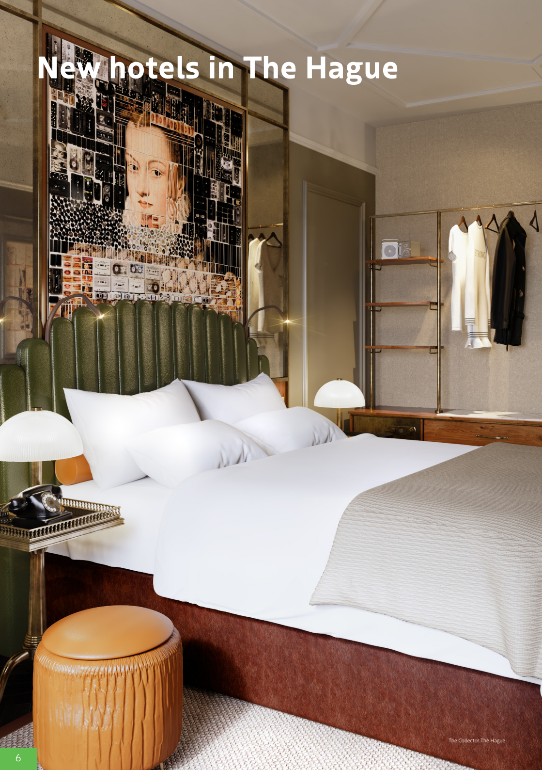
The Collector The Hague

In recent years (from 2018) hotels with around 440 rooms have been opened. In addition, at least 975 new rooms are expected to be built in the next two years. Here you will find a few of our newest hotels and hotels expected to be build.