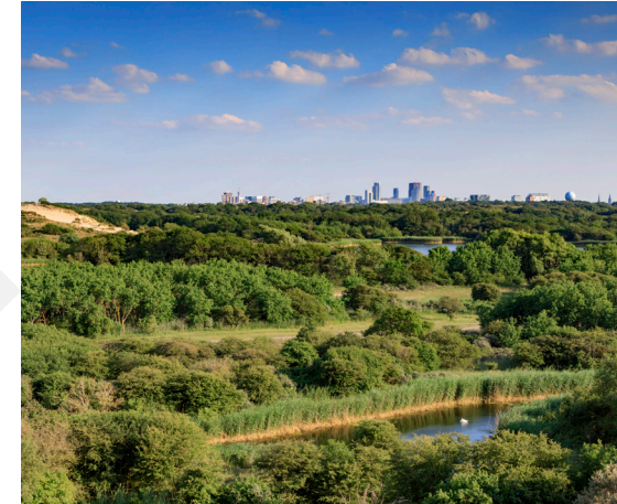
Green city

The Hague has a charming and historical city centre where shops are open seven days a week. It's a compact area where you find vintage, fashion and department stores and art galleries within walking distance.